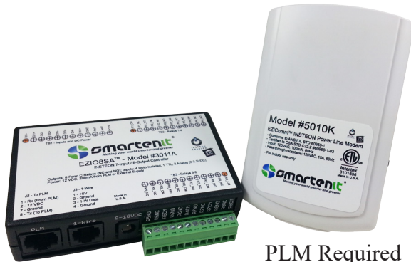
PLM Required (not included)